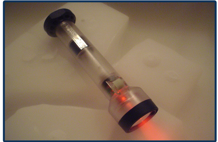
NightStar CS w/ Red LED