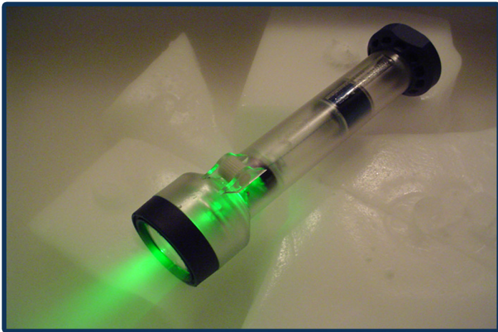
NightStar CS w/ Green LED